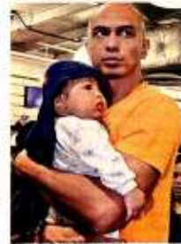
A father tells of how he and his baby son escaped the acid attack near Nelson Street.