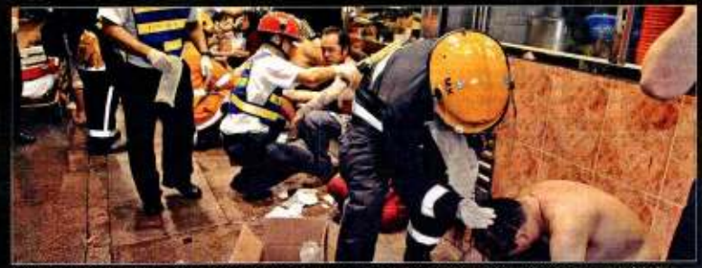
Rescuers attend to the injured in Mong Kok after a bottle of acid, left, was thrown into the street — just hours after surveillance cameras were switched on.